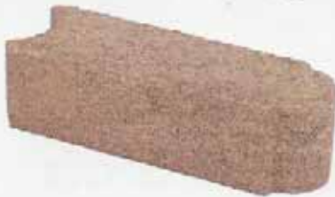
Lawnedge Estimating Chart