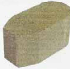
4in1 Edger Estimating Chart